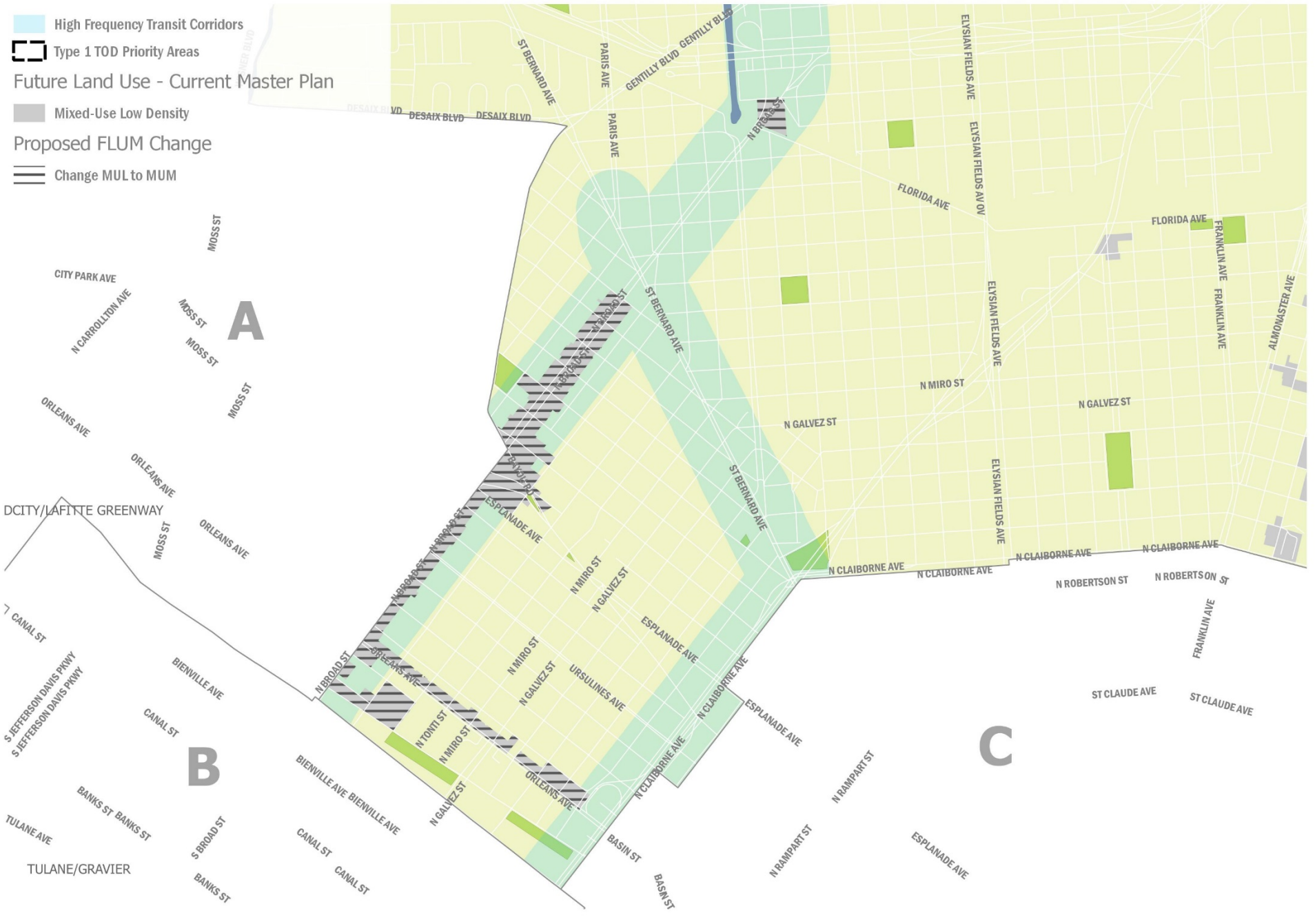
District D – Map Areas to Change MUL to MUM on Future Land Use Map