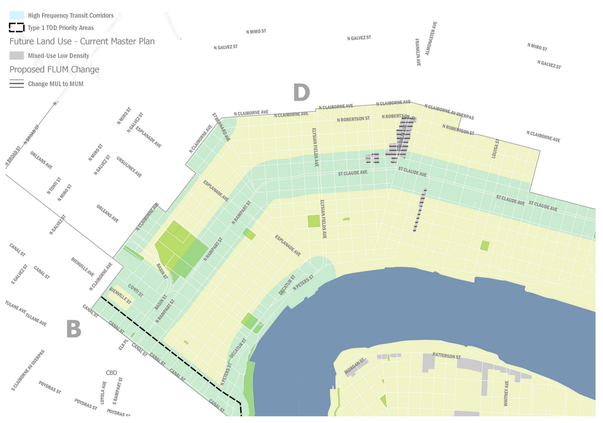
District C – Map Areas to Change MUL to MUM on Future Land Use Map